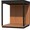
Kirami FinVision® -terrace M Misty