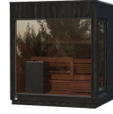
Kirami FinVision® -sauna M Misty (Right), Harvia Virta Combi 10,8 kW