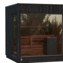
Kirami FinVision® -sauna M Misty (Left), Harvia Virta Combi 10,8 kW