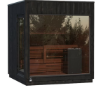
Kirami FinVision® -sauna M Misty (Left), Harvia Virta Combi 10,8 kW